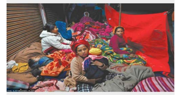
Women and children take shelter in a tent at Khalanga Bazar, Jajarkot on Saturday evening

Local authorities and relevant stakeholders need orientation on gender equality and gender-based violence to address safety concerns associated with a lack of shelter.